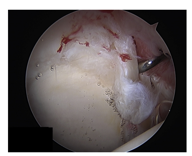
Fig 1. Arthroscopic view from an anterolateral portal in a right hip in a 56-year-old female patient showing an extensively torn and degenerative labrum.